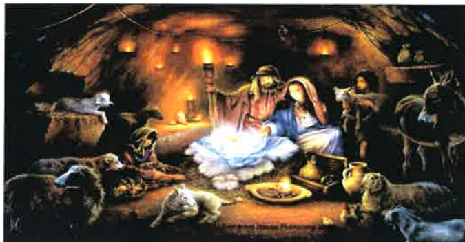
THE NATIVITY OF THE LORD

December 24, Christmas Eve, 5pm & 12 Midnight @ St. Mary's