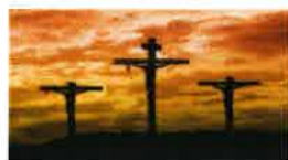
Stations of the Cross immediately following Mass